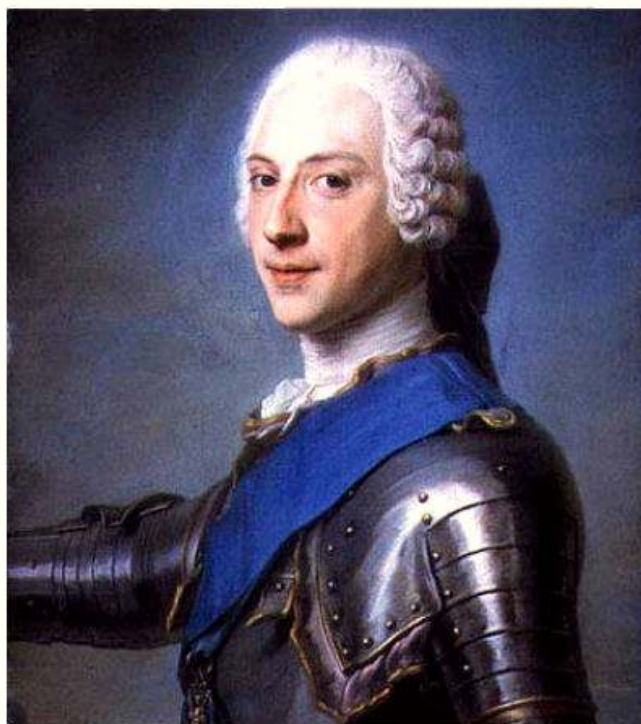
Prince Charles Edward Stuart 1722 - 1788