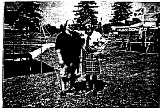
Dunardry and myself at the Oberlin Ohio Scottish Games

Editor of the Non Oblitus Special Edition