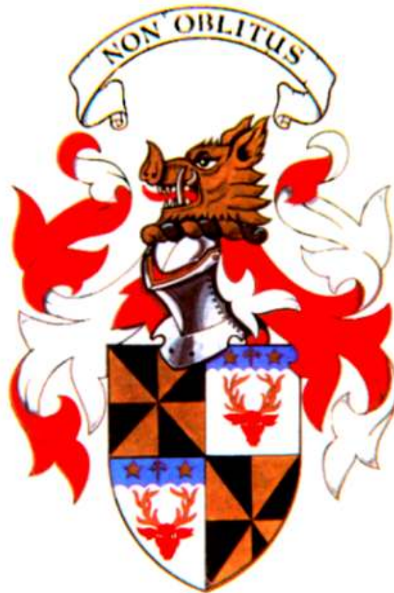
The Armorial Bearings of LACHLAN MACTAVISH OF DUNARDRY

The Chief's Arms Matriculated April 17, 1793