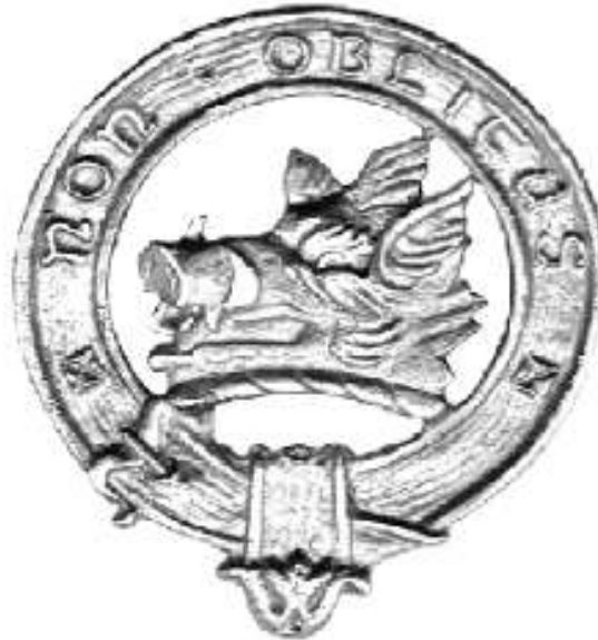
MacTavish Clansman Badge

This badge, with the Crest of Clan MacTavish, a Boar's Head within the strap and buckle, is a symbol of our family kinship and an ever-present reminder of an age-old custom and is a means of showing pride in our heritage.